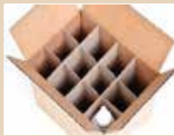
PARTITIONS / DIVIDERS