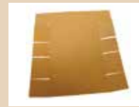
FIVE PANEL FOLDER