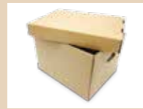
HALF SLOTTED CONTAINER