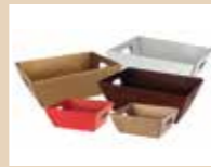
CREASED & SLOTTED TRAYS