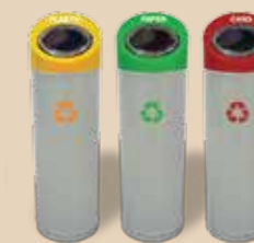
MULTI RECYCLE BIN