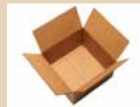
REGULAR SLOTTED CONTAINER