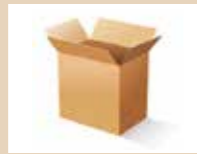
FULL FLAP SLOTTED CONTAINER